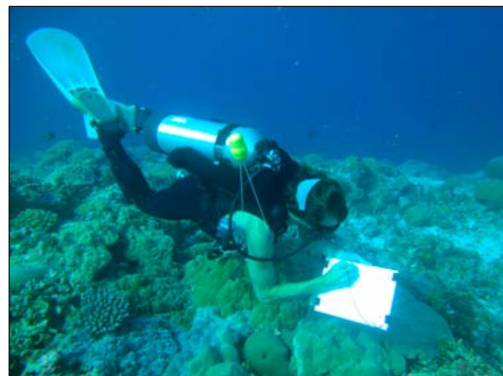
Cosmoledo coral reef monitoring.