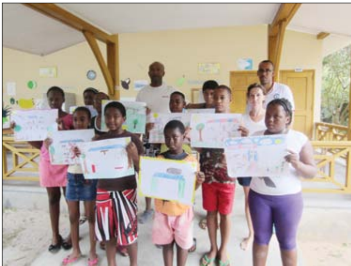
Kids from Silhouette and their sustainable energy vision.

By AURÉLIE DUHEC, ISLAND CONSERVATION SOCIETY