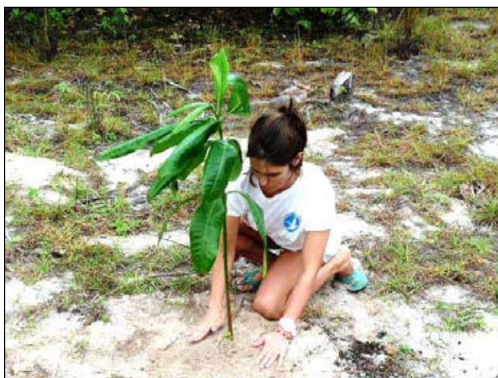
ICS staff planting trees.

The SIDS conference in Samoa echoes the importance of the fragility and vulnerability of Small Islands and ICS will continue to pursue sustainable activities that lead to the increased protection of small islands.