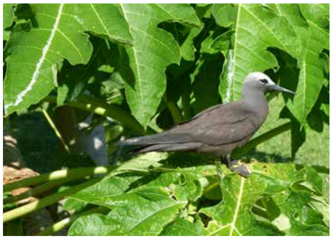
Lesser Noddy Anous tenuirostris is smaller and lighter than Brown Noddy with a finer proportionately longer black bill. Birds breed in trees mainly during the southeast monsoon from April to October, but some are usually to be seen at the island year-round. Unlike the more widespread Brown Noddy, it breeds only in the Indian Ocean, the nominate race at Seychelles, Cargados Carajos, Reunion and Maldives, with a second race at western Australia.

Aride may be home to the world's largest colony of this species.