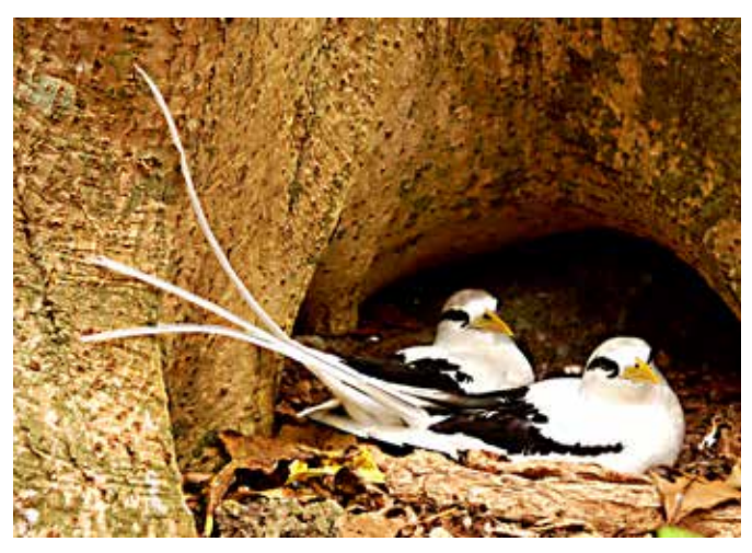
White-tailed Tropicbird Phaethon lepturus is one of the world's most elegant seabirds. They are strong fliers, diving to take fish and squid or even catching flying fish in flight. The white stiletto-like shapes are unforgettable against a clean blue sky. Pairs mate for life and may breed at any time of year. The local name for a tropicbird is Payanke, meaning 'straw-in-tail', probably the oldest Creole bird name, used by sailors before Seychelles was even settled.