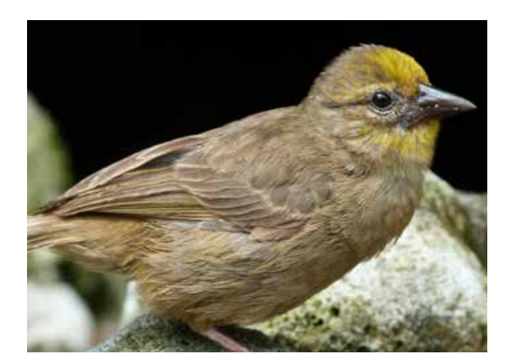
Seychelles Fody Foudia sechellarum or Toktok is a small dumpy endemic weaver, found only on Aride and a few other islands. There is little overlap in diet between Seychelles Fody and Madagascar Fody. The Seychelles Fody is mainly insectivorous, whereas Madagascar Fody is a seed eater. Where the two occur together, the cheeky aggressive manner of the Seychelles Fody gives it a distinct advantage.