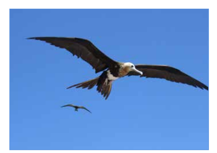
Great Frigatebird Fregata minor will attack other seabirds to force them to drop their catch but can also take prey on the wing. It is unable to land on the surface of the water because its small, unwebbed feet will not give sufficient thrust to take off again and the plumage is not waterproof. However, frigatebirds are maestros of flight. They have the lowest wingload factor of any bird and are surprisingly light, with pneumatic flexible bones that make up just 5% of their weight – less than any other bird.