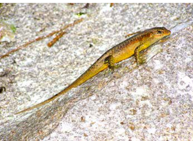
Wright's Skink Trachylepis wrightii is only found on rat-free seabird islands such as Aride where it benefits from the large numbers of seabirds, feeding on discarded fish and squid, fallen or unattended eggs, dead birds and even the droppings of nestlings. Like Aride's unique shrub Wright's Gardenia, it is named after Edward Perceval Wright from Ireland, who visited Seychelles for six months in 1867 and was the first naturalist to collect specimens. Most skinks are small and this is one of the largest species in the world.