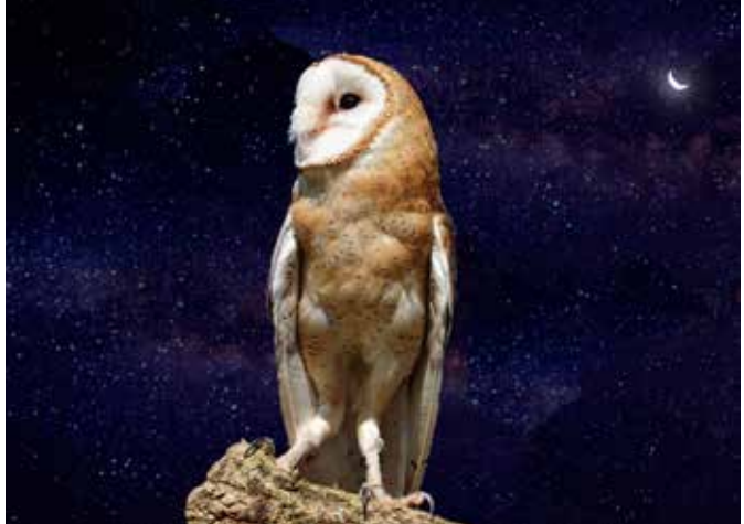
Barn Owl Tyto alba was introduced to Mahé (race affinis) in 1951 and is now resident on the larger granite islands. The introduction was supposed to be to control rats, but instead bird populations have suffered including Fairy Tern and Roseate Tern. The Barn Owl is the most widely distributed species of owl in the world and one of the most widespread of all species of birds, found almost everywhere in the world except for the polar and desert regions.