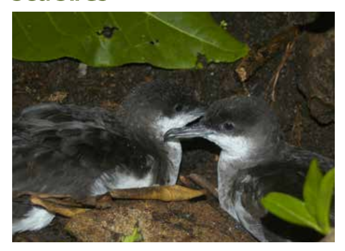
Tropical Shearwater Puffinus bailloni is the only small and the only black-and-white shearwater breeding in Seychelles. Aride may hold the largest colony in the world. Birds depart before dawn and at sunset they return from their feeding forays at sea, emitting strange eerie calls. Shearwaters struggle to take to the air from their woodland nest sites, so shortly before dawn, they climb up boulders and tree trunks to gain height prior to lift-off.