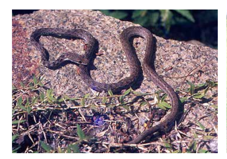
Seychelles Wolf Snake Lycognathophis seychellensis is a non-venomous snake of up to one metre in length, one of two snake species endemic to Seychelles. There are two distinct colours: yellow phase or dark phase. Yellow individuals have a yellowish-brown back and a bright yellow underside. Dark phase snakes are grey or blackish with a white spotted underside. It has a small head and conspicuous, fairly large, coppery-gold eyes. It is listed as Endangered by IUCN (International Union for the Conservation of Nature).