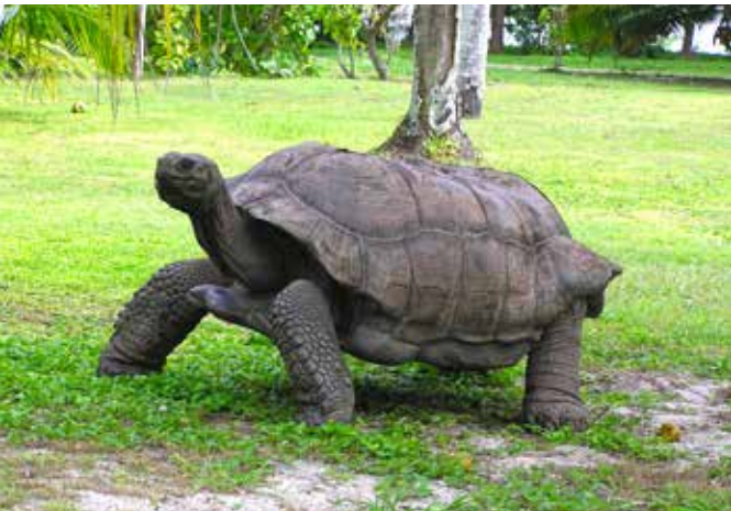
Aldabra Giant Tortoise Aldabrachelys gigantea is the only surviving species of a family once found throughout the western Indian Ocean islands. Most of the Indian Ocean species were wiped out by 1840 following the arrival of European settlers. Aldabra Giant Tortoises were reintroduced to Aride to aid the recovery of Seychelles Magpie-robin. The birds follow tortoises to feed on invertebrates disturbed in the leaf litter.