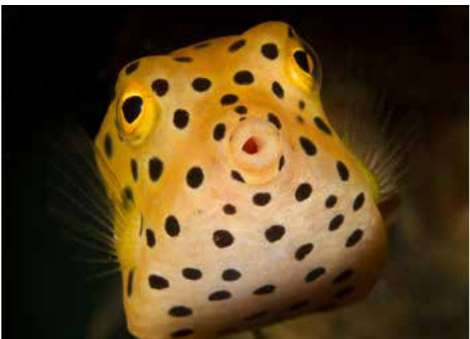
Boxfish Ostraciidae are small to medium-sized (to 40 cm) fishes with a body almost completely encased in a bony shell. Out of the 26 species in the Ostraciidae family, five have been recorded at Aride. Members of this family occur in a variety of different colours and are notable for the hexagonal or 'honeycomb' patterns on their skin. They swim in a rowing manner and feed on benthic invertebrates. Several species are considered delicacies in southern Japan, although some species are reported to have toxic flesh.