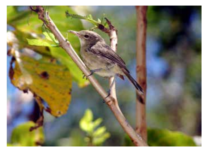
Seychelles Warbler Acrocephalus sechellensis is a small unobtrusive pale brown warbler often heard before it is seen, giving away its presence with a melodious whistle. Birds move actively through vegetation feeding on invertebrates picked from the underside of leaves. Seychelles Warbler was once confined to Cousin, where the population declined to just 29. Birds have subsequently been successfully translocated to several islands including Aride, which now has the world's largest population.