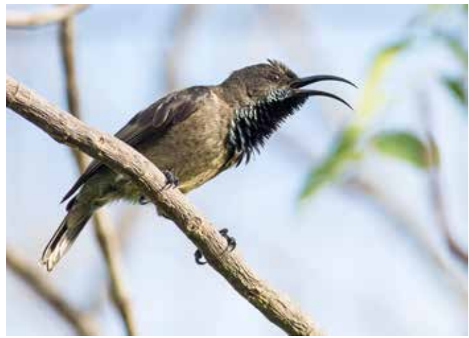
Seychelles Sunbird Nectarinia dussumieri is a small highly active bird, that flits from tree to tree. Although rather dull coloured compared to its continental cousins in neighbouring Africa, the male has bright orange or yellow pectoral tufts and a dark blue iridescence on the head and throat. The female is somewhat smaller and duller. Seychelles Sunbirds disappeared from Aride when the island was cleared of most trees. However, with the regeneration of vegetation, birds naturally recolonised the island.