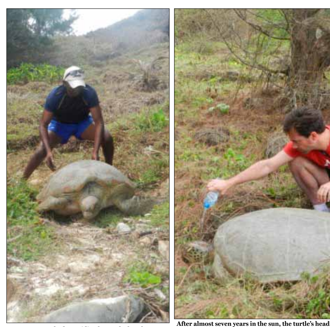
Rangers had to guiding her to the beach.