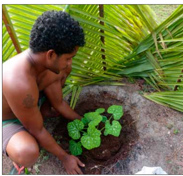
The importance of planting.

and our island partners: Since our first days on the island, we have been warmly welcomed by the islanders. We feel happy on Farquhar, we have a good relationship with the staff, which is