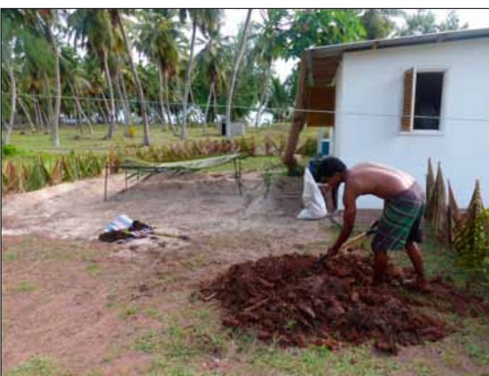
Three weeks later.

very important in a restricted area and small community. Fly Castaway and Island Development Company (IDC) are very supportive. IDC provided us with house, office and manpower. Be-