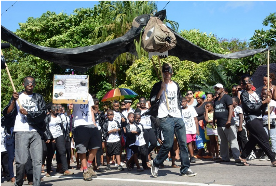
ICS launched a campaign with T-shirts and cups with 'Save Our Bat' printed on them. (Seychelles News Agency) Photo License: CC-BY

"ICS has already put in place various measures to try and save the bats' precarious ecosystem on Silhouette. These include an awareness campaign to prevent the over-usage of pesticides commonly used to control mosquitoes, which could reduce the population of moths, beetles and other insects that the bats feed on," said Khan.