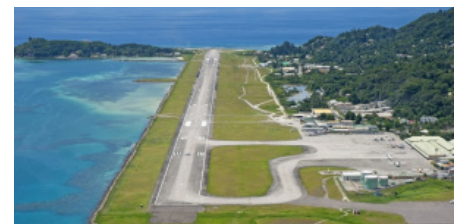
Major upgrade planned for Seychelles International Airport