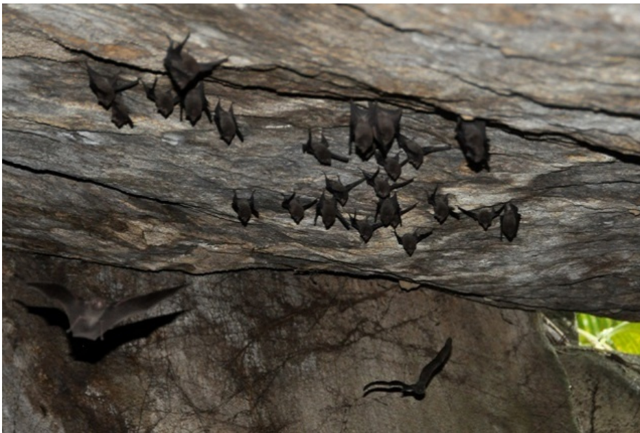
The sheath-tailed bat commonly known by locals as sousouri bannann can be distinguished from others by the sheath behind their hind legs.

Victoria, Seychelles | February 20, 2022, Sunday @ 08:43 in Environment » SPECIES | By: Alisa Uzice Edited by: Betymie Bonnelame | Views: 1639