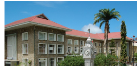
IMF agrees to help Seychelles with a $107 million economic reform plan