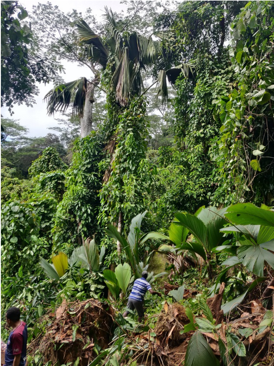
The endemic coco de mer is facing threats of the sprawl of invasive plants that could potentially affect its future existence on Silhouette.