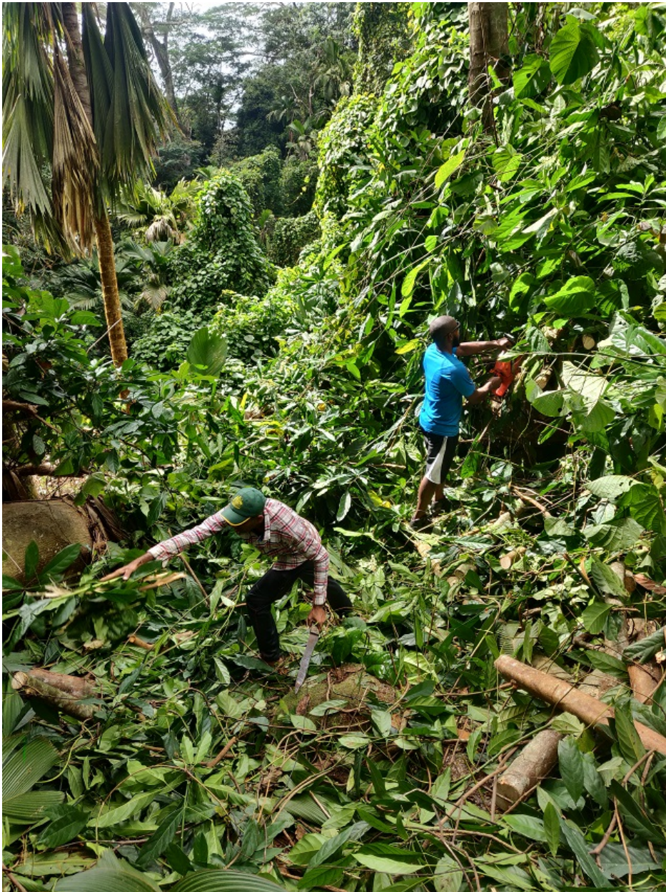
The team tackling the invasive plants on the steep trail which leads to the Jardin Marron garden of coco de mer palms.

The invasive plants first grow in small areas, then extend rapidly, crawling onto indigenous species, strangling, and smothering them. The plants can grow up to 20 metre and can easily suffocate the garden's population of towering adult coco de mer plants, as wells as the juveniles.