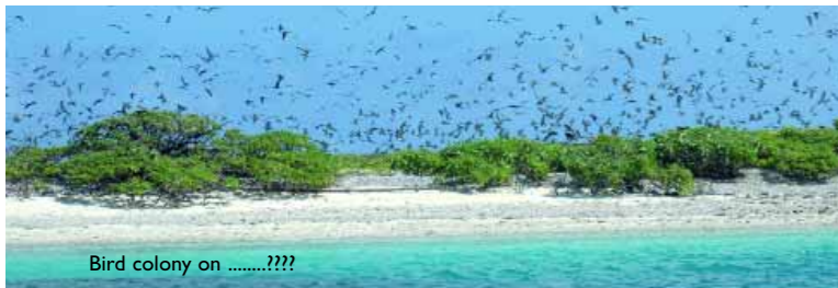
Bird colony on .....????

The Island Conservation Society is a Seychelles registered NGO established in 2001 by a group of local people concerned that little was being done to promote the conservation and restoration of small islands, especially the outer