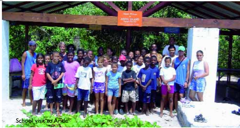
School visit to Aride