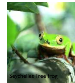
Seychelles Tree frog