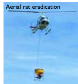
Aerial rat eradication