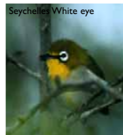
Seychelles White eye