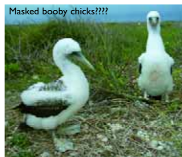
Masked booby chicks????