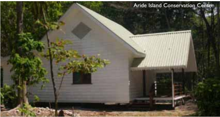
Aride Island Conservation Center

ICS needs your help to achieve this ambition. Your support will help directly towards our conservation programmes, enabling us to employ qualified personnel to protect the islands, carry out monitoring and research, and publish technical and educational documents and improve facilities for visitors.