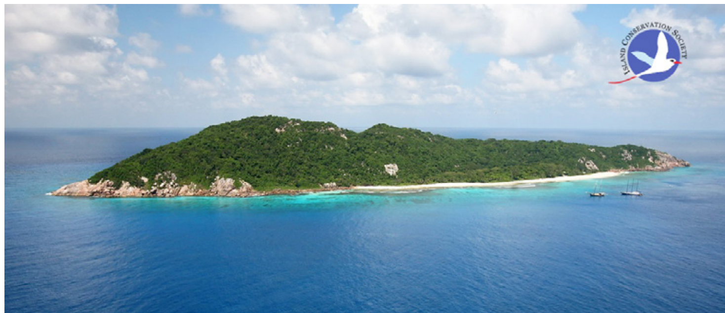
Aride Special Reserve is only open to visitors during the North-West Monsoon

based on Praslin is available on the Aride Island Website at www.arideisland.com or from the ICS Head Office. The reserve team will do their best to accommodate your preferred day during the week for your visit, but please note that the Special Reserve may be closed for reasons of weather or interference