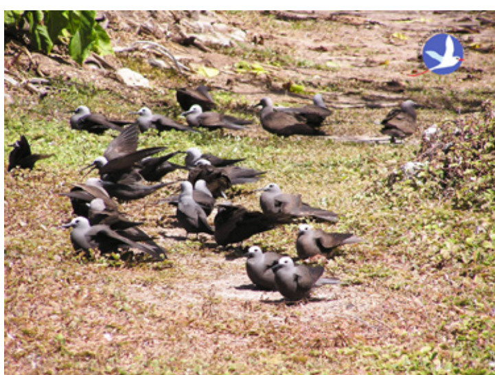
Brown noddies sunbathing