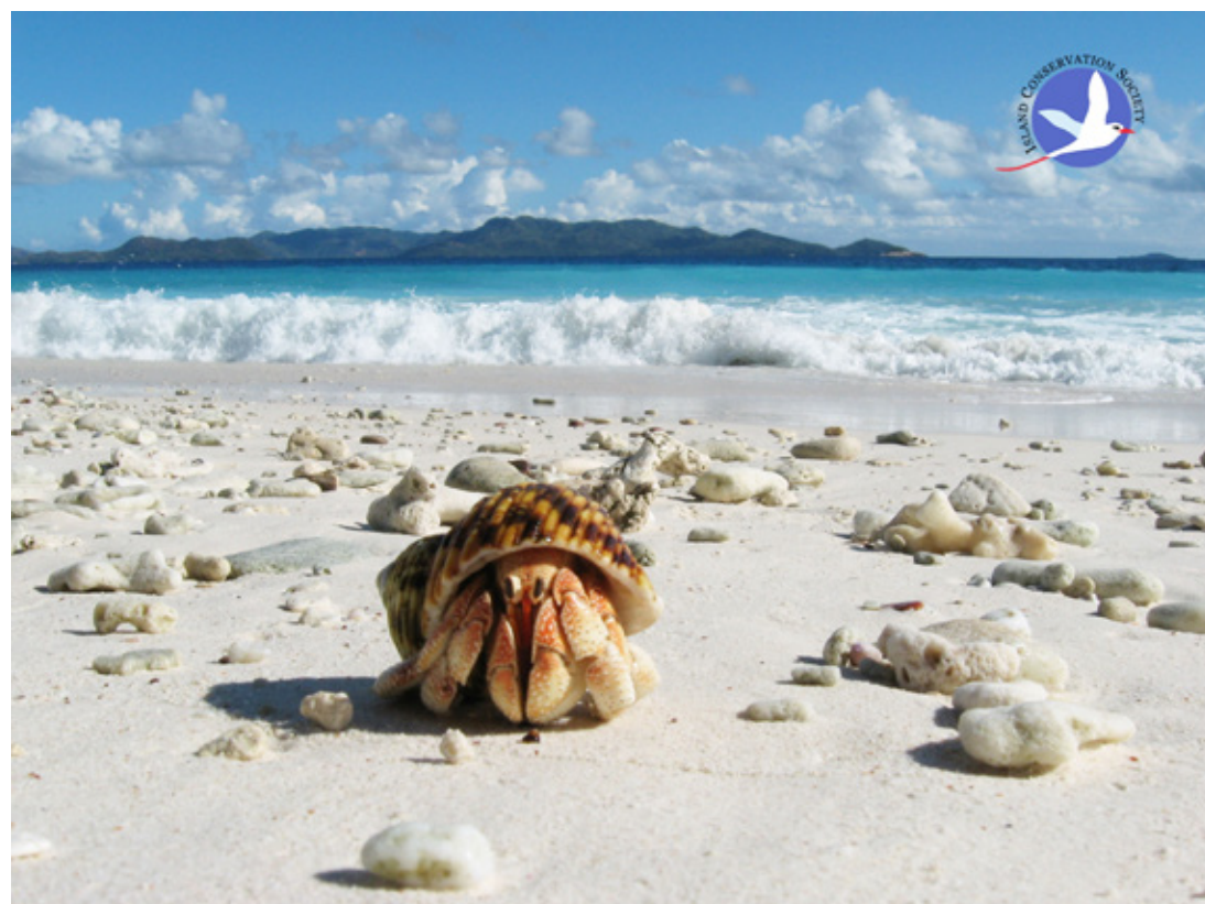
The orange hermit crab. Removal of any plant or animal material from the reserve is strictly prohibited