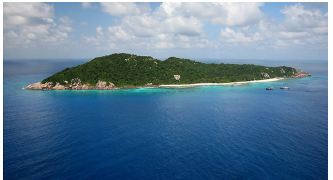
Aride Island Special Reserve