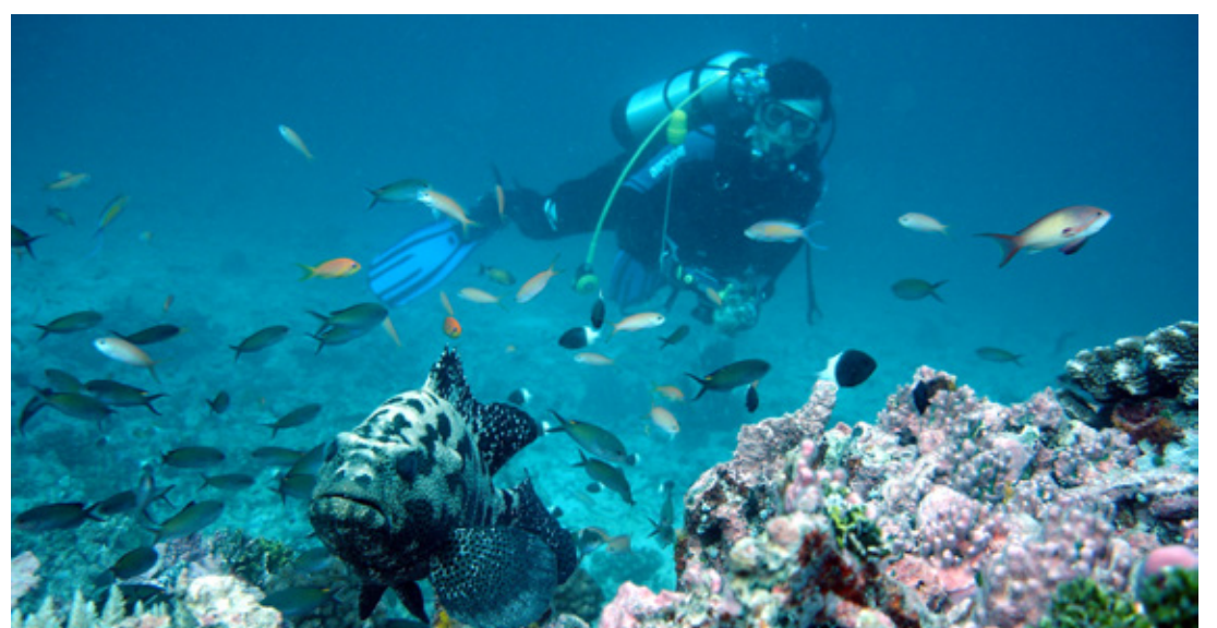
Thriving Coral reef amid changes in sea temperature