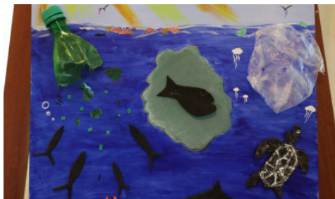
Exhibit 4: Plastic the inferior: The display shows the negative effects of plastics on ecosystems and biodiversity