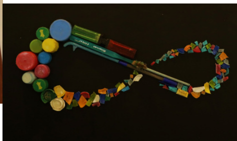
Exhibit 3: To infinity and beyond: An eternity of plastics. This display illustrates the fact that plastics do not decompose