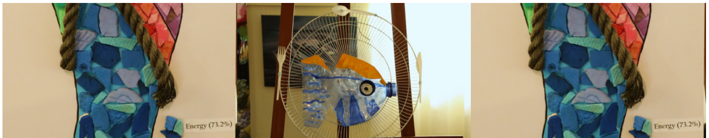
Exhibit 5: The Carbon flop-print: This display describes how plastics production contribute to the global carbon footprint and climate change