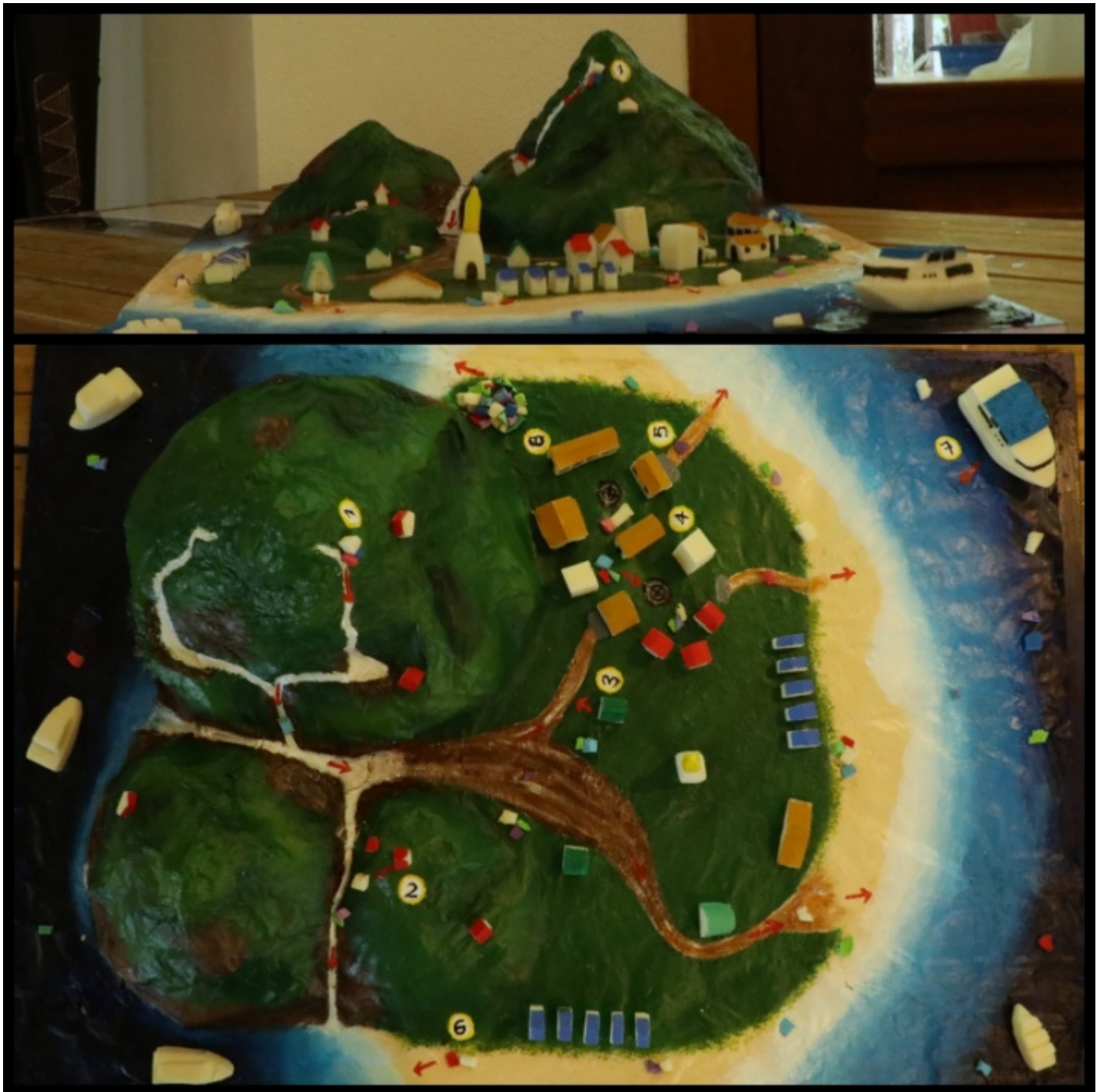
Exhibit 1. Go Plastics: Where is your rubbish going? The display shows the sources of marine plastic pollution and their routes from the mountains towards the ocean

Welcome to the New Year, the perfect moment for setting new life goals. This year, the Island Conservation Society remains committed to raising public awareness on environmental issues for better implementation of its conservation programmes.