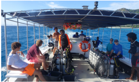
The team getting ready onboard