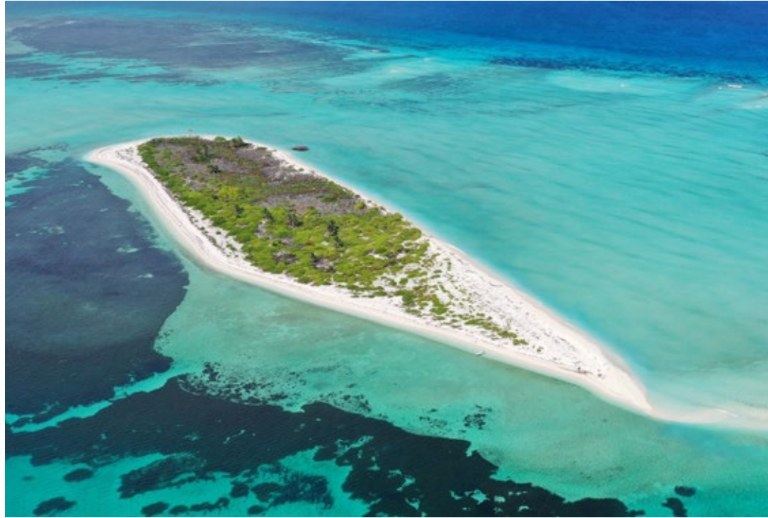
Bancs de Sable - This mature sandbank on the western rim of Farquhar could be an example of what the new structure will become.

The Island Conservation Society (ICS), who set up a conservation centre on Farquhar in 2014, routinely records the dimensions of notable sandbanks using GPS devices, allowing them to track the stages of this new formation. Its location, known as Derrick by Islands Development Company (IDC), owes its name to a nearby wreckage of a cargo crane (known as a derrick). In late 2019, ICS observed that the sandbank here had gained eleva-