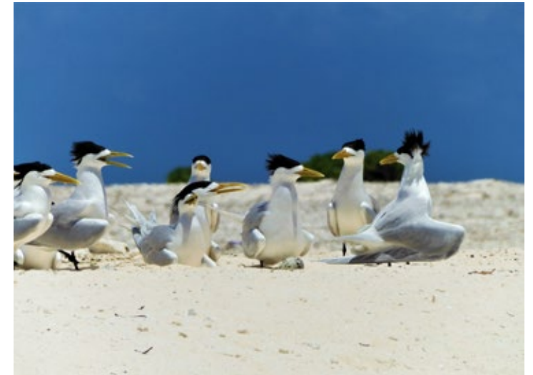
Greater crested terns shading breeding on the sandbank.