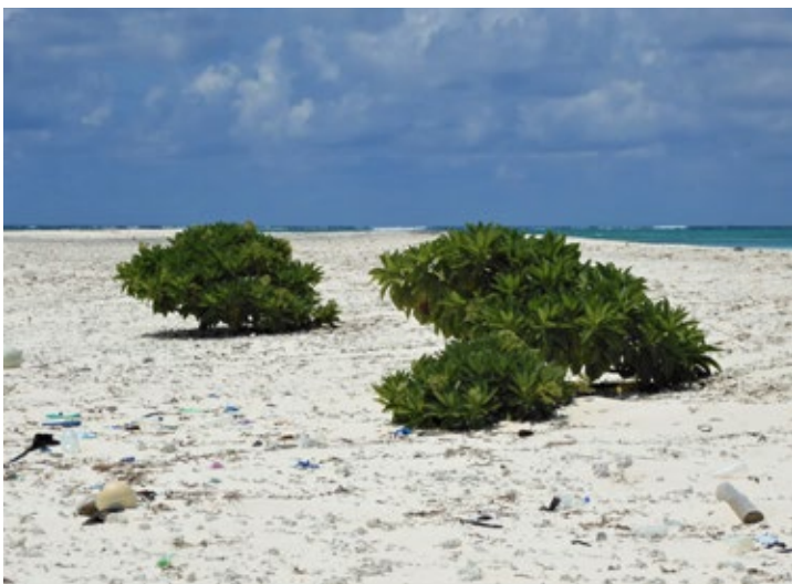
Bwataba after 1 year of growth.