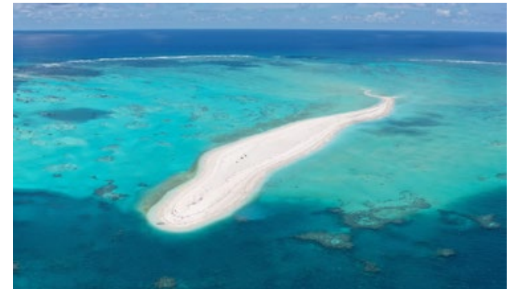
Photo of Derrick sandbank - Aerial shot of Derrick Sandbank taken in 2020.