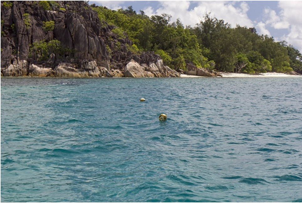
Visitors to the island can enjoy the beach and snorkelling as the seas surrounding the island is protected.

During the past seven months, the authority carried out upgrade work on its existing facilities as well as the construction of new ones. "The upgrade work is taking place in two phases. The first phase includes new, bigger, improved barbeque area facilities at both Baie Laraie and Anse St José. Toilet facilities have also been improved and the 433-metre boardwalk, which is the longest in Seychelles, has also been upgraded," explained the chief executive of SNPA.