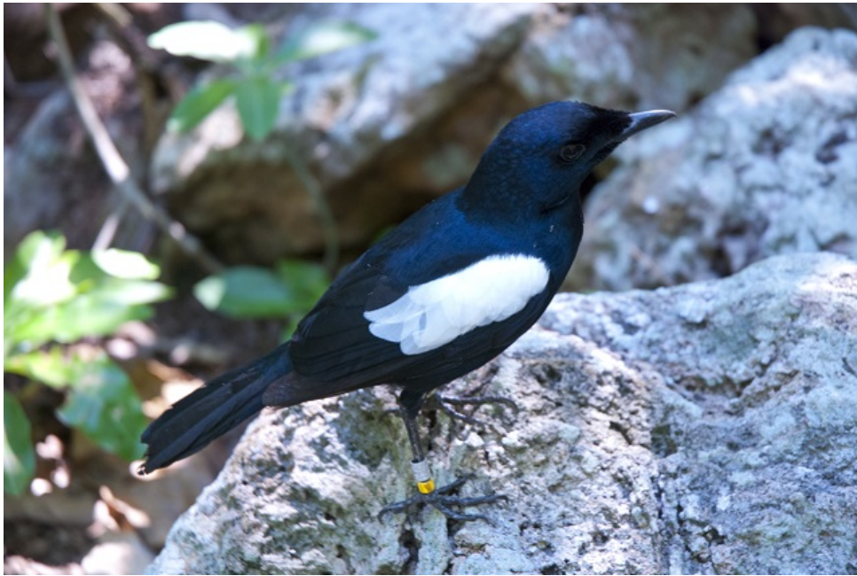
The magpie robin is one of the five species of endemic birds found on Aride.

Aride Island is home to one of the most important seabird populations in the Indian Ocean with more breeding species than any other island in Seychelles. Its population include 18 species of native birds - including five only found in Seychelles, 115 islands in the western Indian Ocean, that breed on Aride.