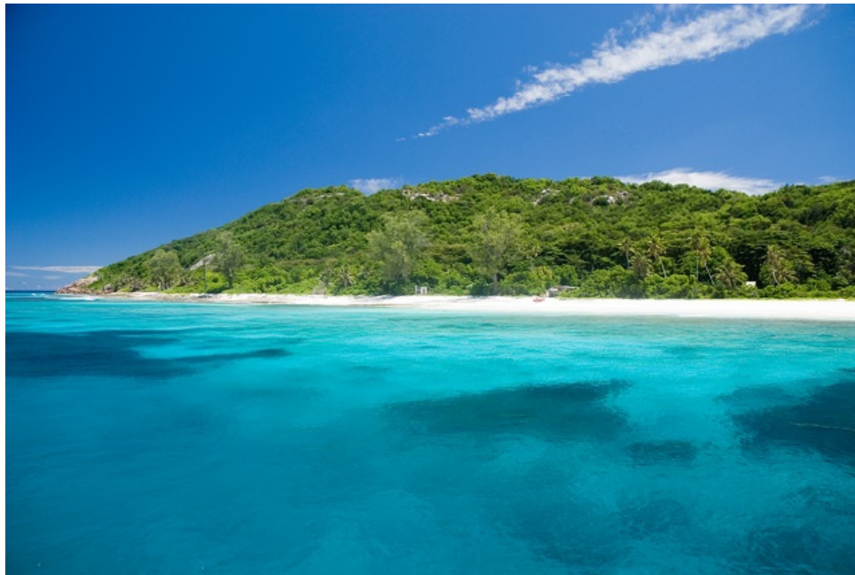
Aride island and Curieuse were this month certified COVID-safe by the Public Health Authority.