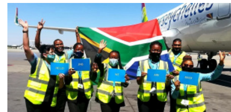
Seeing market opening, Air Seychelles slowly resuming flights to overseas destinations