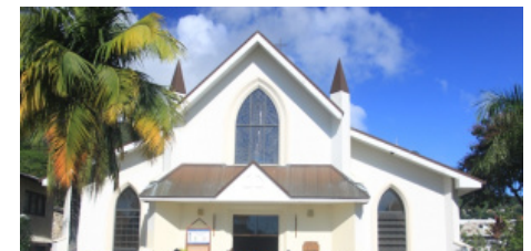
Seychellois welcome new freedoms that come with relaxation of COVID measures