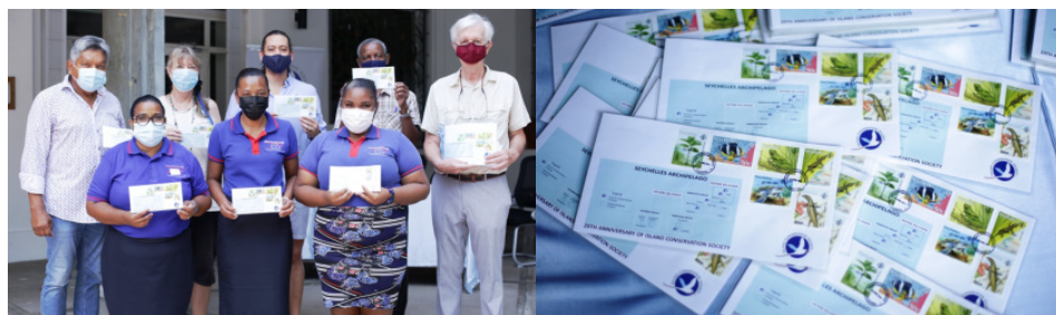
A souvenir photograph marking the occasion