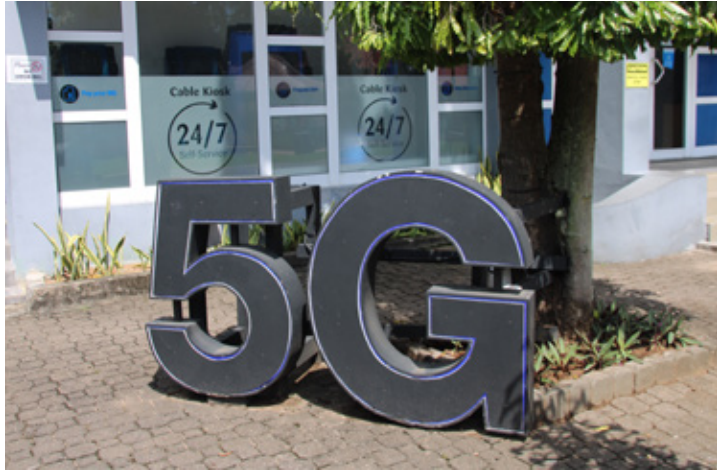
CWS has finally rolled out their 5G service package

"5G had been activated since its launch, but the pandemic has severely affected the rollout, as in it had affected our ability to get set packages out. When you need to launch proper packages, it is a bit more complicated. You need Apple, for instance, to certify it, which has been done, and you