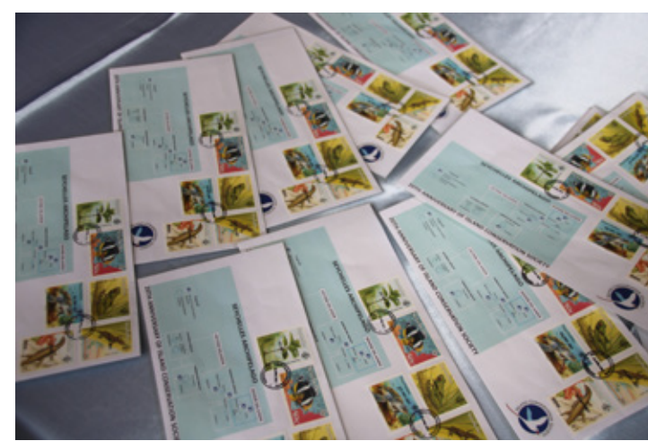
The commemorative postal cover is now on sale at the Post Office gift shop for SCR100

An overprint takes an existing stamp, and it commemorates a special event or perhaps a change in currency or a change in value. It is an additional layer of text added to the face of an existing