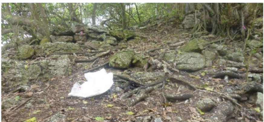
Water bottles and trash left behind by poachers.