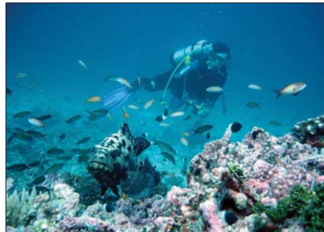
Thriving Coral reef amid changes in sea temperature