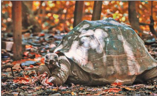
Aldabra Giant Tortoise roams freely on the island ( Aldabrachelys gigantea )